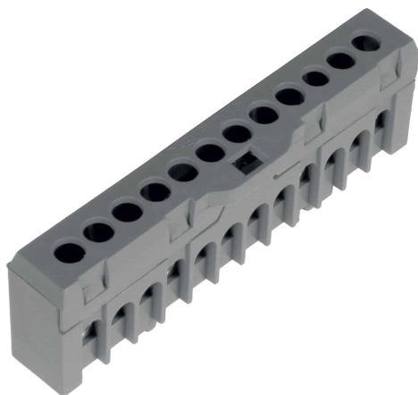
unipolar distribution terminal board, 12 x 10 mm 2 , grey